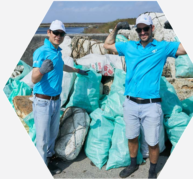
Hai Long beach clean up

On a final note, on behalf of our employees and directors, we would like to express our sincerest appreciation to our shareholders for the confidence you continue to demonstrate while we pursue our growth objectives. Thank you for your continued support and we look forward to updating you on our progress in 2021.