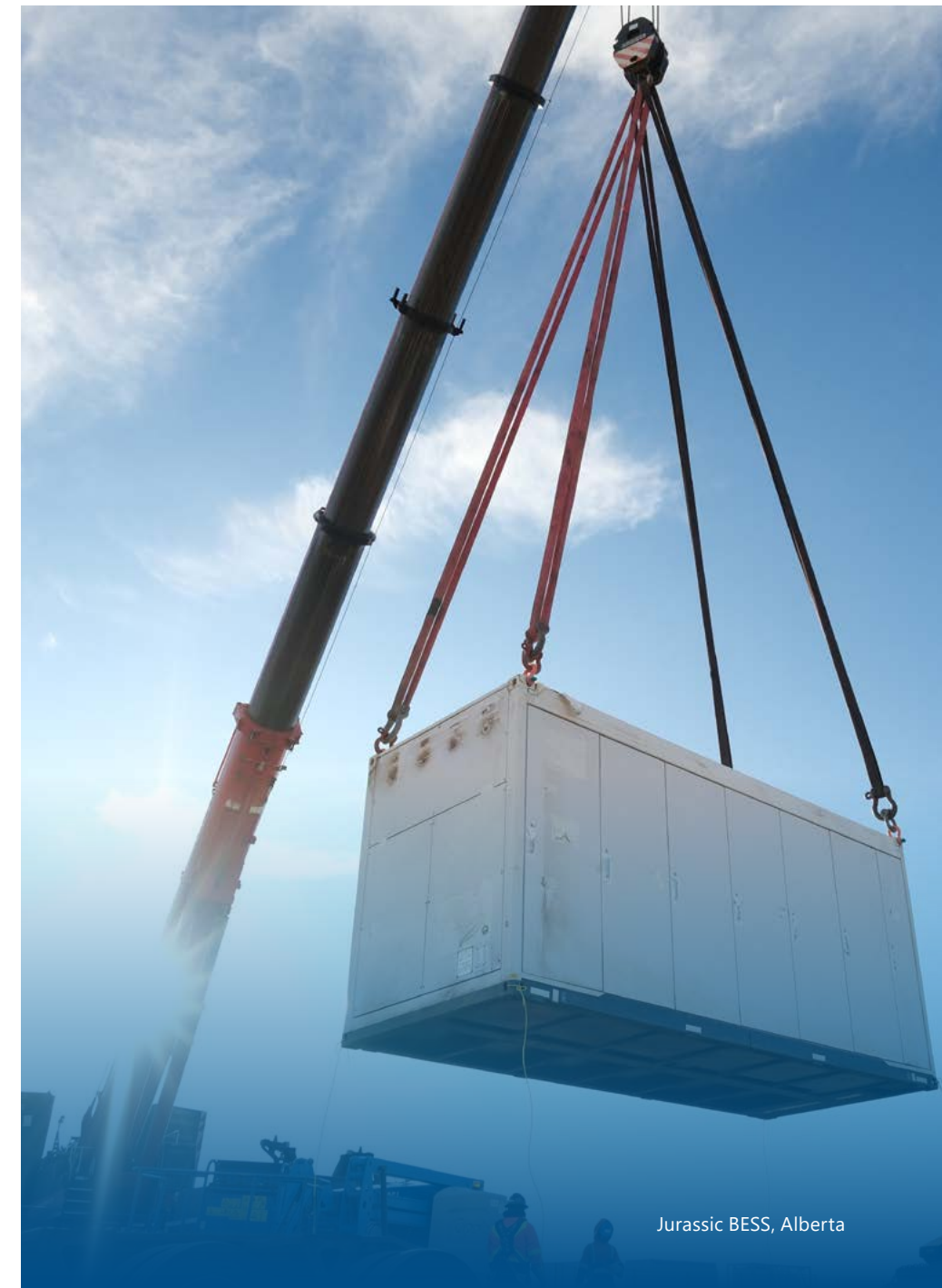
Jurassic BESS, Alberta

During the Reporting Period, we transitioned our operating structure from three technology-based business units to two regional hubs, International and the Americas, working with a global project delivery team. As of December 31, 2025, Northland employed approximately 1,160 individuals globally, across its global offices, project sites and operating facilities.