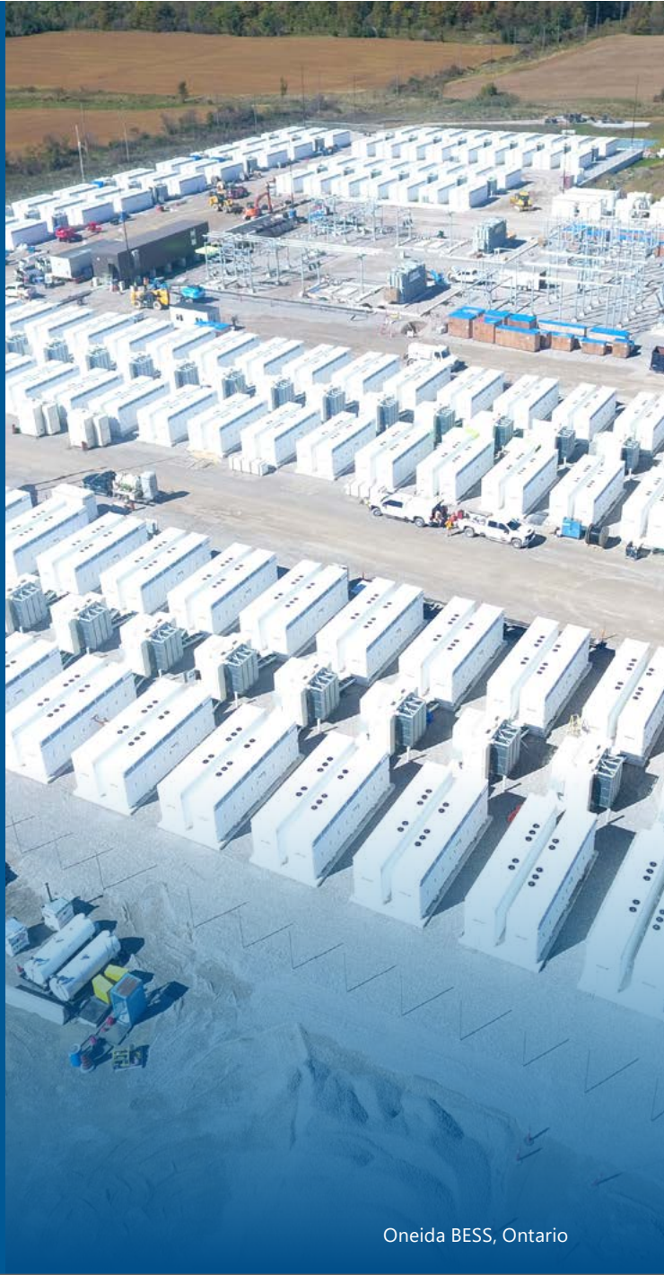
Oneida BESS, Ontario