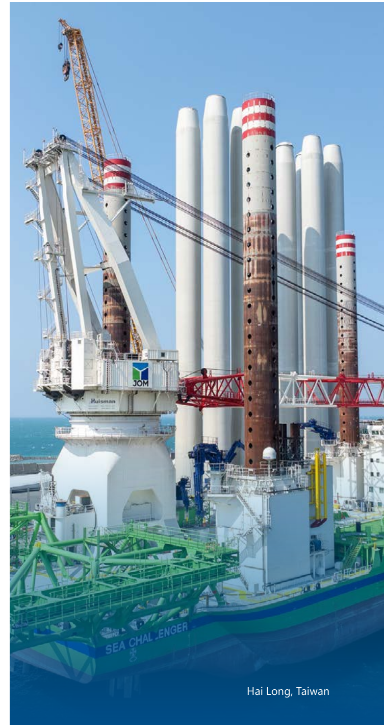
Hai Long, Taiwan

Northland engages with local and Indigenous communities in connection with development, construction, and operation of our projects. Engagement activities support project planning and ongoing operations and are intended to foster trusted partnerships with local and Indigenous communities.