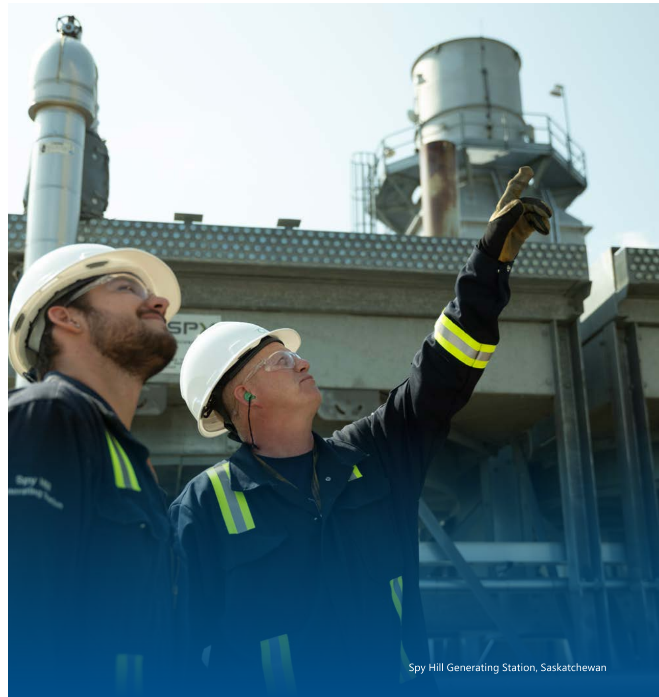
Spy Hill Generating Station, Saskatchewan

Northland updated the Code of Business Conduct and Ethics and Whistleblower Policy during the Reporting Period. The accompanying mandatory training is scheduled to be delivered to employees during 2026.